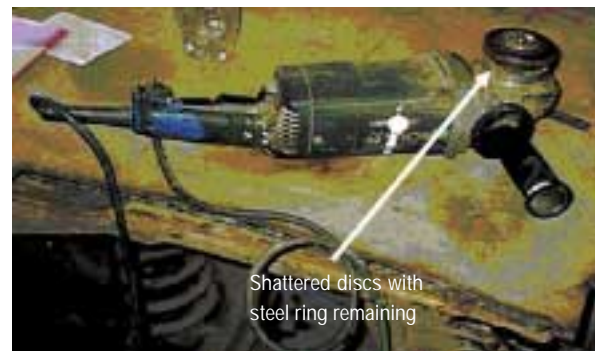
Photograph 2: Unguarded grinder with shattered discs